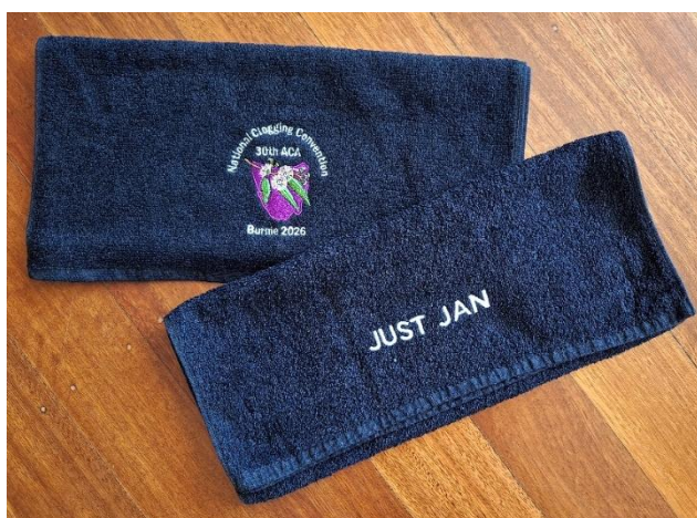
Towel - $17

(Canningvale bleach-proof salon towel 40cm x 76cm)